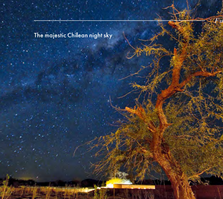
The majestic Chilean night sky