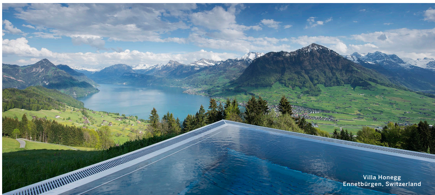
Villa Honegg Ennetbürgen, Switzerland