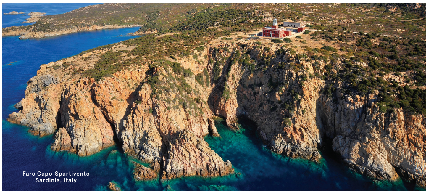
Faro Capo-Spartivento Sardinia, Italy